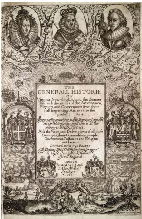
John Smith, The Generall Historie of Virginia, New-England, and the Summer Isles.

Virginia, founded in 1607, was from the start a cog in the commercial system of empire. Having failed in their quest for gold, and also in their attempts to raise silk, citrus products, and other potentially lucrative cash crops, Virginians turned after 1620 to intensive tobacco-cultivation. The same was true of those who founded Maryland, around 1635, as a refuge for Catholics fleeing the rising pressure of Puritanism in old England. This focus lay behind the distinctive settlement pattern of the Chesapeake colonies—where numerous, more or less isolated, “plantations” lay stretched out along rivers and ridgelines, with little in the way of village-style contact among them.