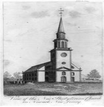
View of the new Presbyterian Church in Newark, New Jersey.

Farming was the focus of productive effort, and most of what was raised went straight to household kitchens and dinner tables. To be sure, after about 1660 a growing class of merchants would create new lines of private enterprise, some of them extremely far-flung, while attaining high levels of wealth and developing a genteel lifestyle to match. This trend, which would not reach its apex until well into the eighteenth century, is nicely encapsulated in the phrase “from Puritan to Yankee.”