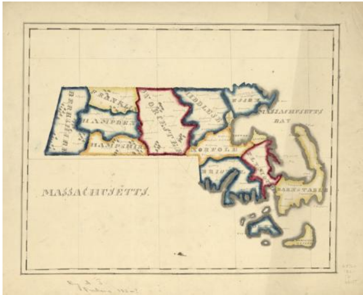
Map of Massachusetts, A.T. Perkins, 1822, Note how every county takes its name from an English counterpart.

Indeed, nearly everything they encountered seemed strange and puzzling. Most of them had no prior experience of a wooded landscape. The forests of their homeland had largely disappeared many years before—hence the American “wilderness” was bound to strike them as darkly menacing. Nor were they much familiar with human difference (people of different race, different culture, different language); in this regard, too, they would undergo a severe jolt upon encountering the native population.