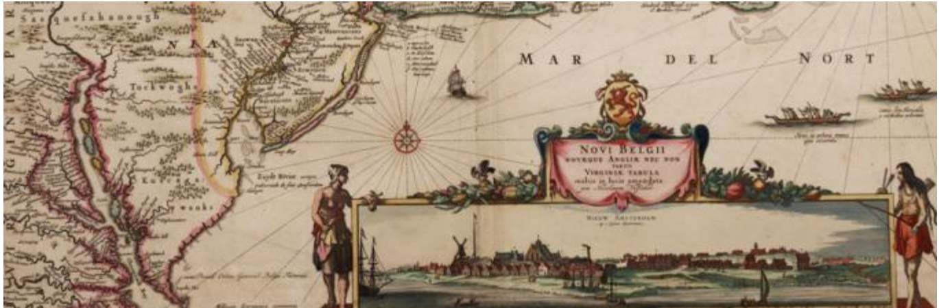
The mid-Atlantic colonies with an inset of New Amsterdam from a 1682 map.

American colonial history belongs to what scholars call the early modern period. As such, it is part of a bridge between markedly different eras in the history of the western world. On its far side lies the long stretch we call the Middle Ages (or the “medieval period”), on its near one the rise of much we connect with modernity. It holds the root of modern science (epitomized by Sir Isaac Newton), of modern political thought (Thomas Hobbes, John Locke), of modern capitalism (the first large joint-stock corporations, including some which financed transatlantic “discovery”), of modern state formation (“nations,” roughly as we understand the term today), of urbanization (most especially, London and Paris, but also colonial cities such as New York, Philadelphia, and Boston), and even of what scholars now refer to as “proto-industrialization” (the earliest factory-style modes of production). Yet for the great mass of European—and American—humanity, the flavor of life at ground level remained highly traditional, including an almost exclusive reliance on subsistence agriculture; immersion in small-scale, face-to-face patterns of social life; and a code of behavior shaped by age-old religious beliefs and folk nostrums.