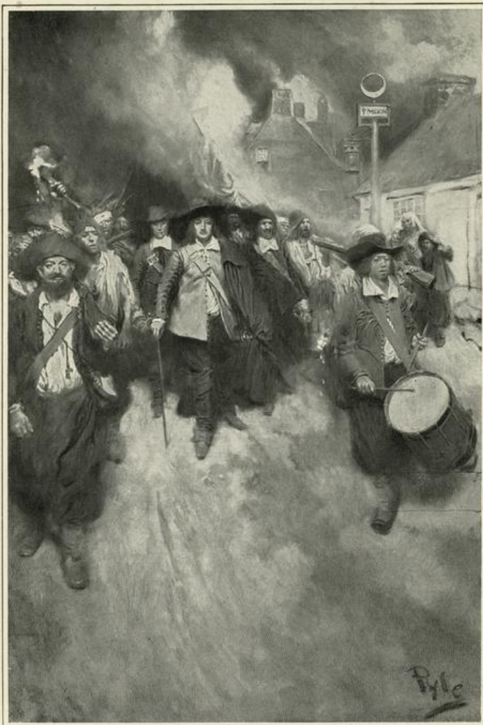
THE BURNING OF JAMESTOWN

The weakest point in this system was the position of the elites themselves—not in their authority over ordinary folk, but rather in their relation to each other. The process of settlement and community-building had created a certain openness at the topmost level. Social credentials, like family pedigree, counted for less on this side of the ocean than on the other. And sudden opportunity—a bonanza tobacco crop, a market success in a rapidly expanding town or county—might push a few men far up the local wealth scale, and embolden them to claim a commensurate political role. In short, leadership might become contested to a degree rarely seen in the more firmly established communities of the Old World.