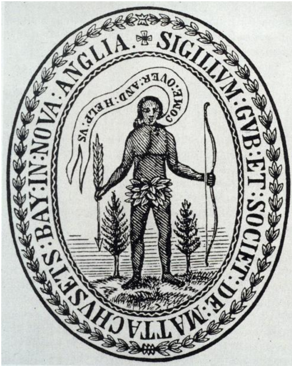
Seal of Massachusetts

At first, their plans mirrored those of the Spanish and Portuguese. For example, the Puritan founders of Massachusetts were strongly bent on converting native “savages”—hence their adoption of an official seal with the image of an unclothed Indian saying, “Come Over and Help Us.” Meanwhile, the first settlers of the region around Chesapeake Bay, starting with Jamestown, Virginia, and its environs, looked more toward material gain; when Captain John Smith arrived there, he found them frantically searching for “gold, gold, gold.”