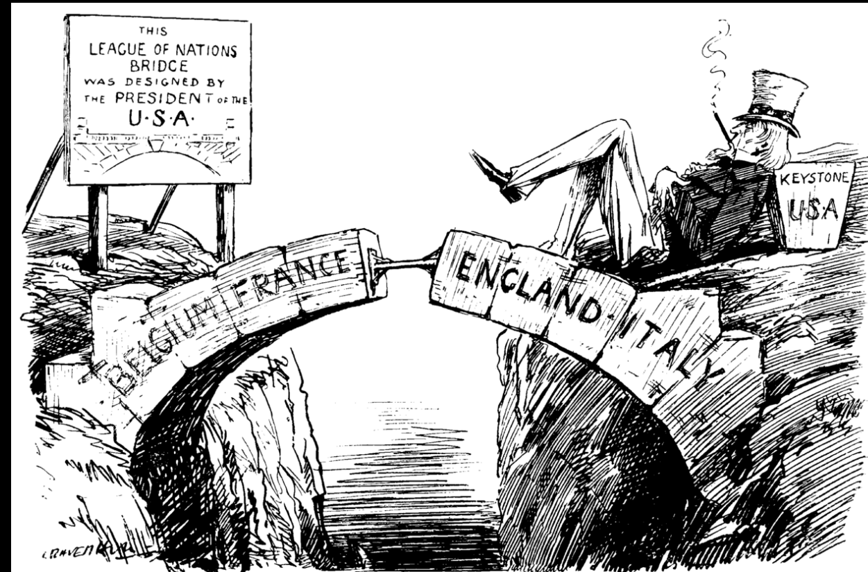
THE GAP IN THE BRIDGE.