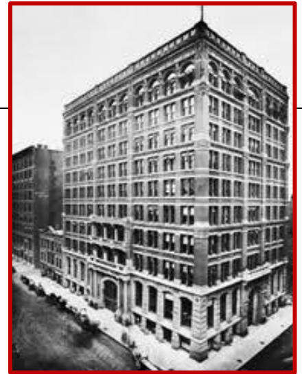
William Le Baron Jenney built the ten story Home Insurance Company building in Chicago (pictured above) which was the first true American skyscraper.

This is an optional assignment. So... young Jedi... what is your choice? Do? Or do not? There is no try.